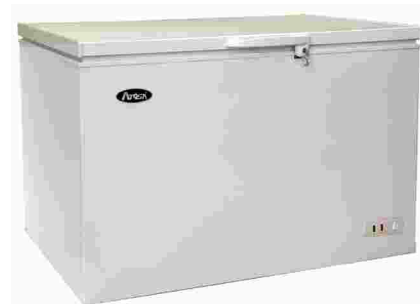
MWF-9010 / MWF-9016

For the best results of food preservation we recommend setting your freezer between 0 °F - 8 °F